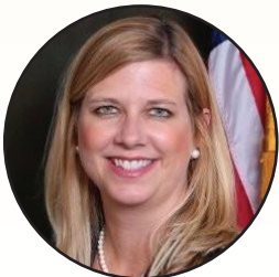
Amy Jacobs Georgia Department of Early Care & Learning Commissioner